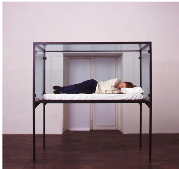
The Maybe. 1995. Installation at the Serpentine Gallery, London

Catégorie: art, exhibition - 6 Commentaires 28 June 2010