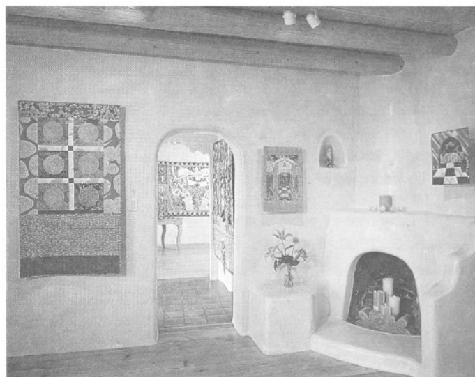
Interior view of Thirteen Moons

Each current professional artist member of SAQA has received in the mail the entry form for the two juried PAM exhibitions to be hosted by these galleries. Each gallery has specific restrictions as to size limits for exhibition, and the artists must choose which gallery to submit entries. Plan to attend the conference, and while you are there, come and see the exhibits, enjoy the opening receptions, and support SAQA by entering your work.