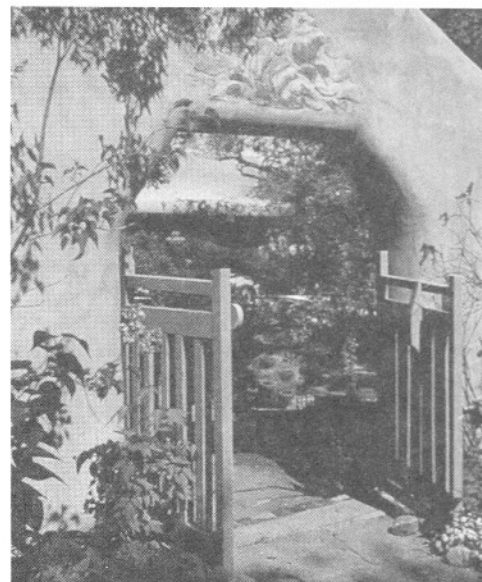
Spanish pueblo style of architecture is prevalent in Santa Fe.

We have reserved a block of 35 rooms at the above rate. This special rate is only available until September 29, 2000. You must make your own reservations. Reservations must be made directly with the hotel and not through a travel agent to receive the discounted rate. Mention that you are with Studio Art Quilt Associates Conference. Call - 800-561-0898 or 505-988-3400; FAX - 505-984-8682; or e-mail - smalwood@rt66.com , for reservations at the hotel. The hotel will require your personal billing information and time of arrival and departure. If you desire to come early or stay after the conference dates, the hotel will work with you regarding rates for additional days.