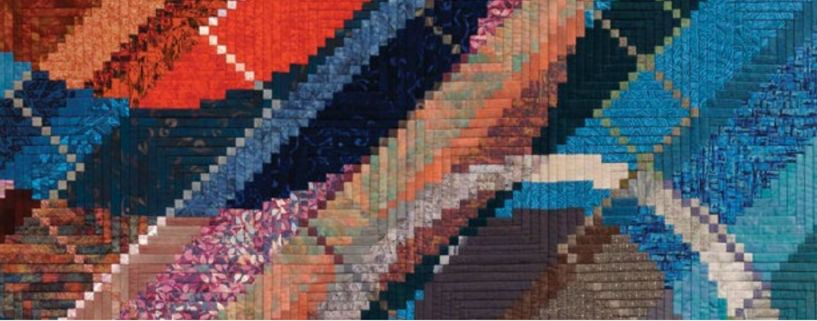
Roundness (detail) by Emiko Toda Loeb see page 19