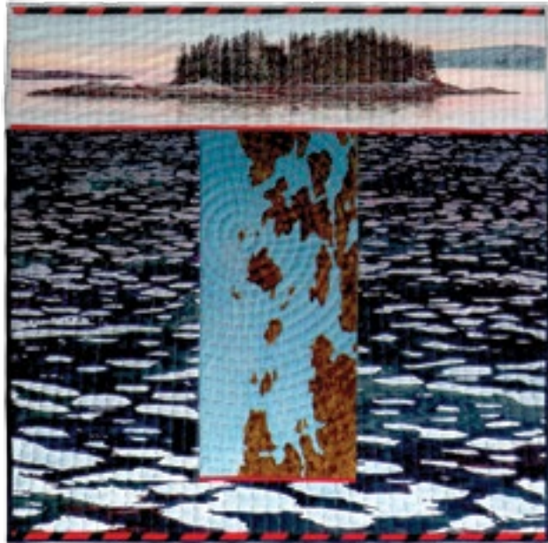
Ram Island, Sheepscot River